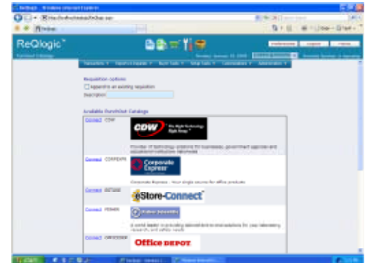
FIGURE 2: PUNCHOUT CATALOG EXAMPLE

ReQlogic includes extensive customization support. Menu icons and favorite shortcuts can be defined to enhance usability. Text customization allows for labels and comments to be changed. Screen-level customization allows you to define new fields and use them within the routing policies. Validation lists can be defined in conjunction with these new user fields. Fields may be marked as required, read only, or hidden. Views can be restricted so that users can see only the values that apply to them (e.g., items, accounts, vendors, etc).