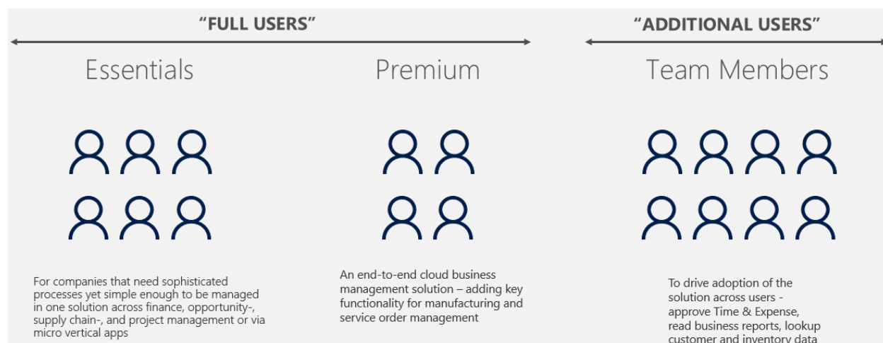
Figure 3: User Types

Additional users often represent a significant percentage of users in an organization and may consume data or reports from line of business systems, complete light tasks like time or expense entry and HR record updates or be heavier users of the system, but not require full user capabilities. These additional users are licensed with Dynamics 365 Business Central Team Members.